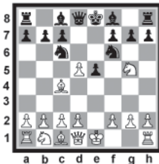
Chess Openings: Two Knights Defense