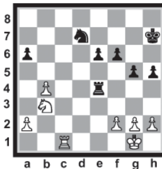
Chess Tactics: White to Set a Pin